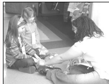
Students Teach Spanish—Page 3