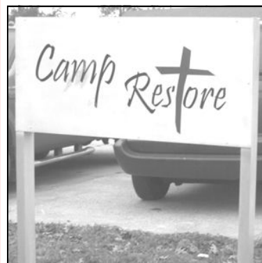
Senior Servant Event—Page 3