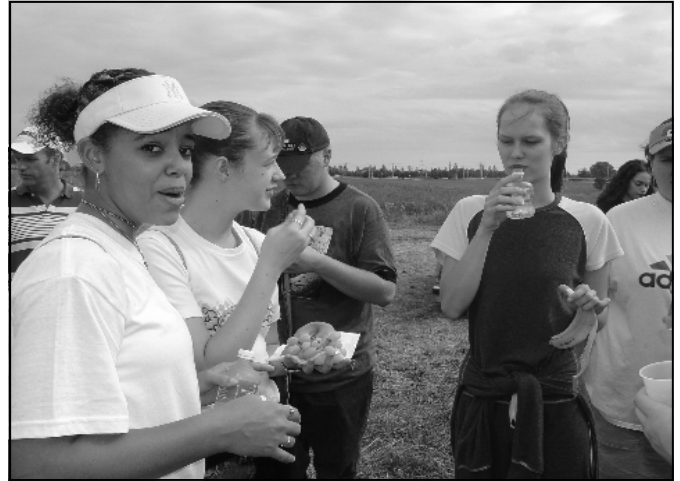
Having walked half the distance of the 10 kilometer Walkathon, students rest at the 33 acre FVLA property site in St. Charles. Sunshine, refreshments, and fellowship made the stop delightful.

The sunshine of success warms the hearts of all who see so many exciting and promising blessings as the school begins its fourth decade of ministry to the families of the Fox Valley area.